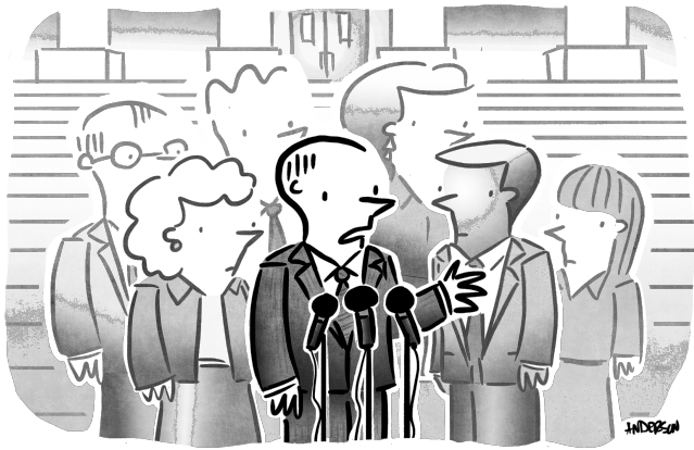
"I haven't yet decided if I'm staunchly in favor, or staunchly opposed. But rest assured, however I vote, it will be staunchly."

It's also extremely easy to explain your decision: Q materially impacts two important things; everything else is less impactful.